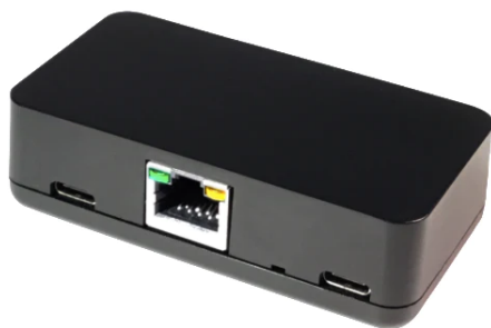
USB-C Ethernet Adapter